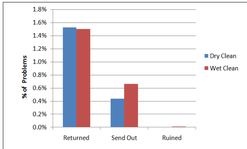
Figure 2: Percentage of problem garments.